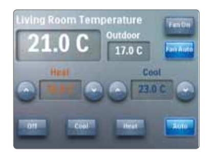
HVAC Adjust climate control and monitor temperature in any room