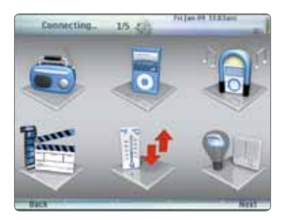
Multi-Room Control your entire multi-room media system in any room

A/V Media server Control media playlists and view status without the need of a television