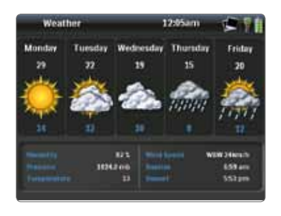
Web & IP Access and monitor live web info and security images in the palm of your hand