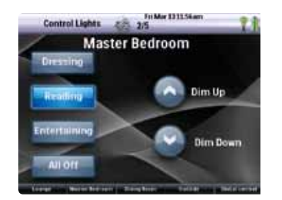
Lighting & Automation Control lighting scenes, moods & individual dimmers with on-screen feedback